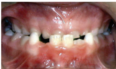
Complete Class III